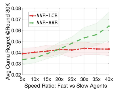
Figure 2: Performance comparison in the "worst" case

Note that the above experimental scenarios are designed to demonstrate the "average-case" performance, since rewards of arms are generated according to real data traces and all arms are randomly allocated to fast and slow agents. However, another important consideration on the efficiency of a learning algorithm is its performance in the worst case. From our theoretical results in Section 4, baseline algorithms suffers severe performance degradation and our algorithm outperforms the baseline algorithms a lot only when the optimal arm lies in a fast agent and there exists some arm with few observations. Specifically, the regret of the AAE-AAE algorithm degrades with the smallest aggregate action rate of agents containing arm i, i \in \mathcal{K} ,