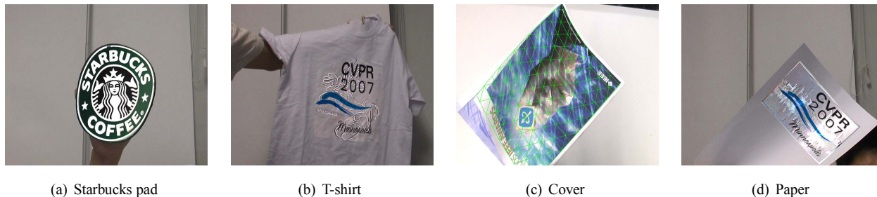
Figure 1. Detecting nonrigid surfaces in real-time video (a-d). (a) The contour is overlaid on the Starbucks pad. (b) T-shirt with shadow. (c) The cover of a magazine. (d) A piece of paper with specular reflection.

quadratic optimization problem, which has a closed-form solution for a given set of observations. Thus, it can be efficiently solved through LU factorization. Then, a progressive sample [5] scheme is employed to initialize the optimization scheme, which can decrease the number of trials significantly. Therefore, the present approach requires much fewer iterations than the semi-implicit iterative optimization scheme [20]. Thus, the proposed method is very efficient for real-time nonrigid surface recovery tasks. To evaluate the performance of our proposed algorithm, we conduct extensive experiments on such diverse objects as a Starbucks pad, a T-shirt, and the cover of a magazine, as shown in Fig. 1.