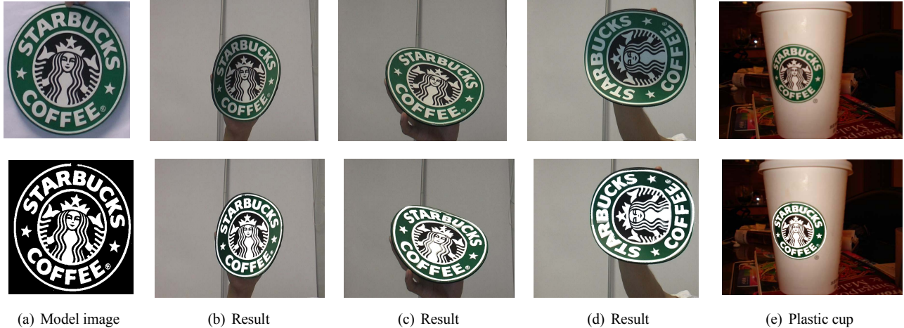
Figure 3. We use a Starbucks pad as the deformable object. The model image is shown in (a) the contour of the model image is extracted using a simple gradient and filling operator, which is overlaid on the input image. (b) to (d) show the results. (e) shows the result where the pad is replaced by a plastic cup. The model contains 120 vertices, and the whole process, including image capturing and rendering, runs around 18 frames per second. More results are included in the supplementary material.